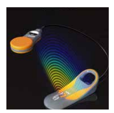
During compression magnetic fields precisely track the distance between chest and back pad.