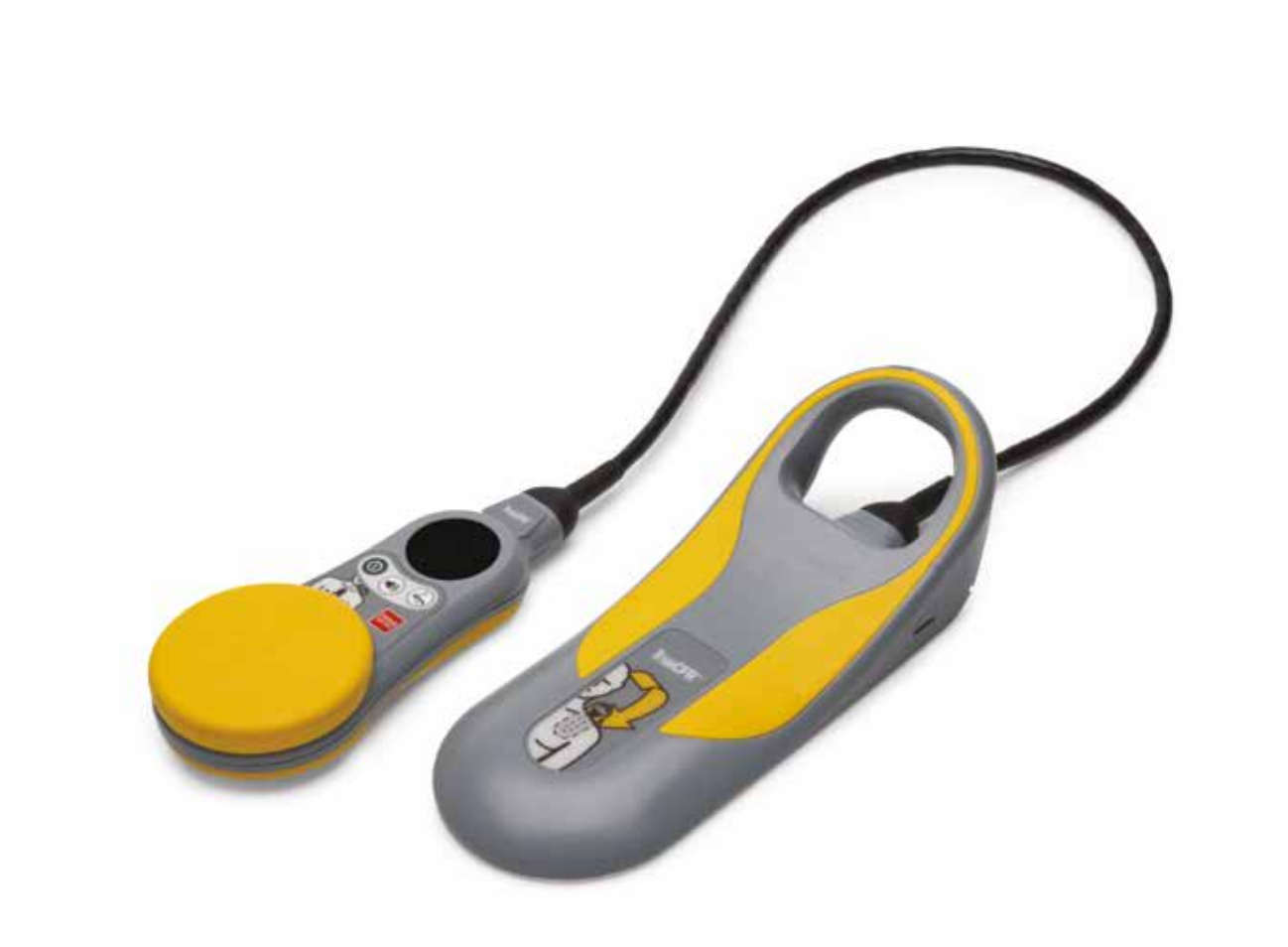
TrueCPR <sup>™</sup>COACHING DEVICE