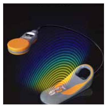
The magnets fire in rapid sequence during chest compressions.